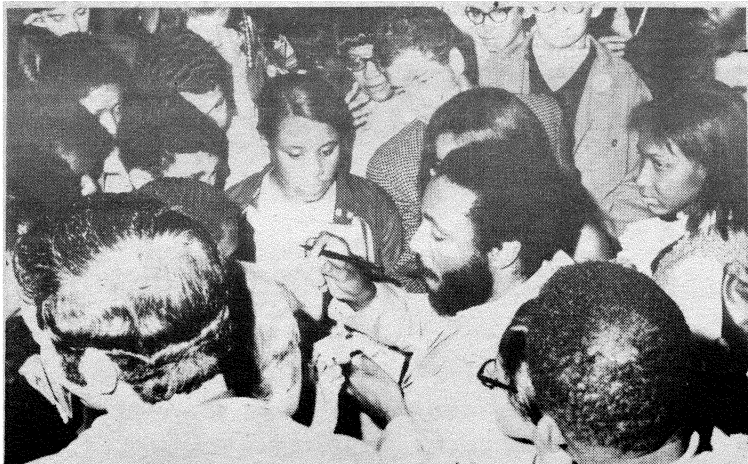
DICK GREGORY WITH STUDENTS

Throughout the lecture, Gregory repeatedly emphasized the idea that young people in this country are faced with problems that the past generation created. He warned the young people not to be fooled by his generation any longer.