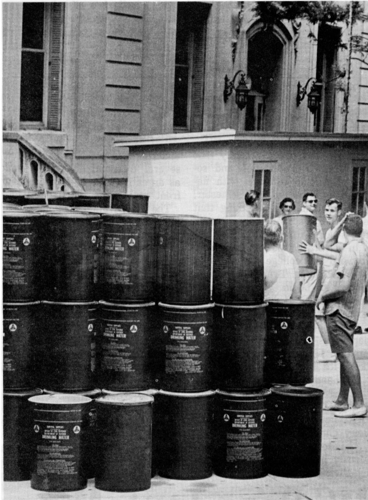
Student volunteer forces work diligently to build blockade.